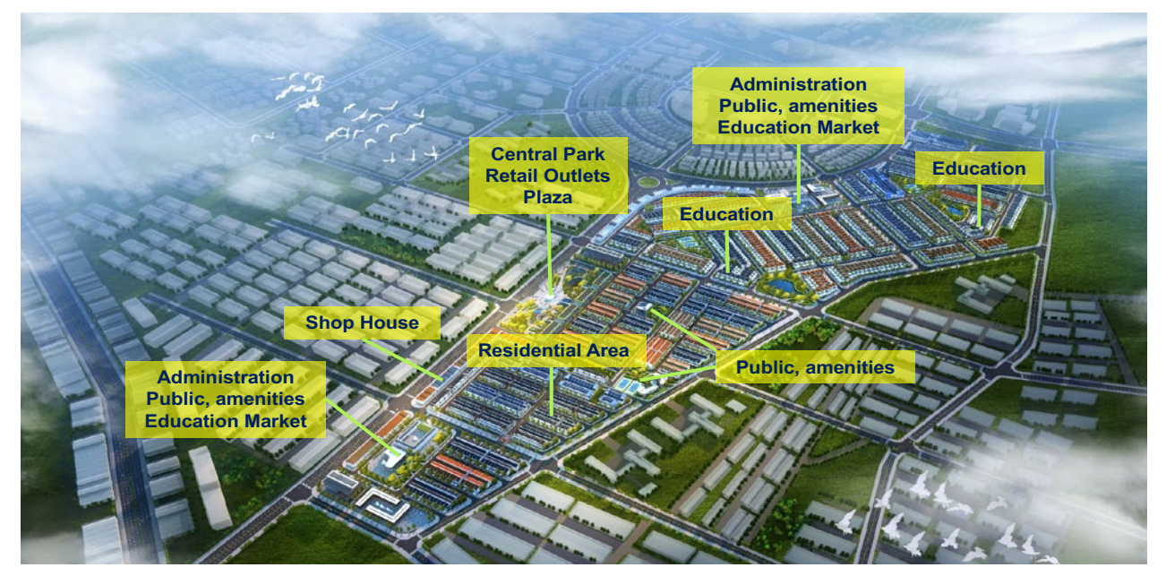
The perspective of commercial and residential area of VSIP Nghe An