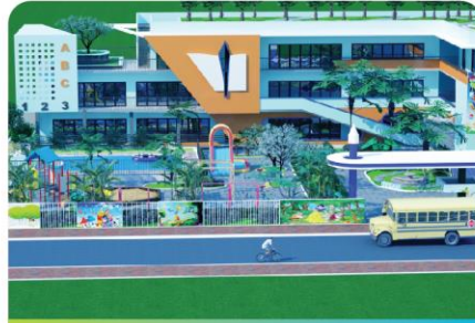
Build to lease

Ideally located land parcels with ready infrastructure, suitable for various type of real estate investment such as: residential, commercial or mix-developed projects etc.