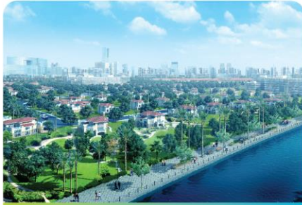
Land for sale

Ideally located land parcels with ready infrastructure, suitable for various type of real estate investment such as: residential, commercial or mix-developed projects etc.